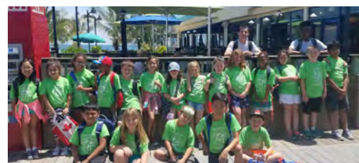
Residents Enjoyed 2017 Community Events Held at Etra Park!