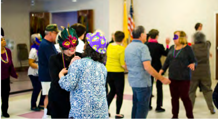
Mardi Gras party

Visit the East Windsor Senior Center located at 40 Lanning Boulevard. The state-of-the-art facility has many classes, events and activities to offer senior citizens 60 years old and over who reside in East Windsor or Hightstown. Contact (609) 371-7192 for further information.